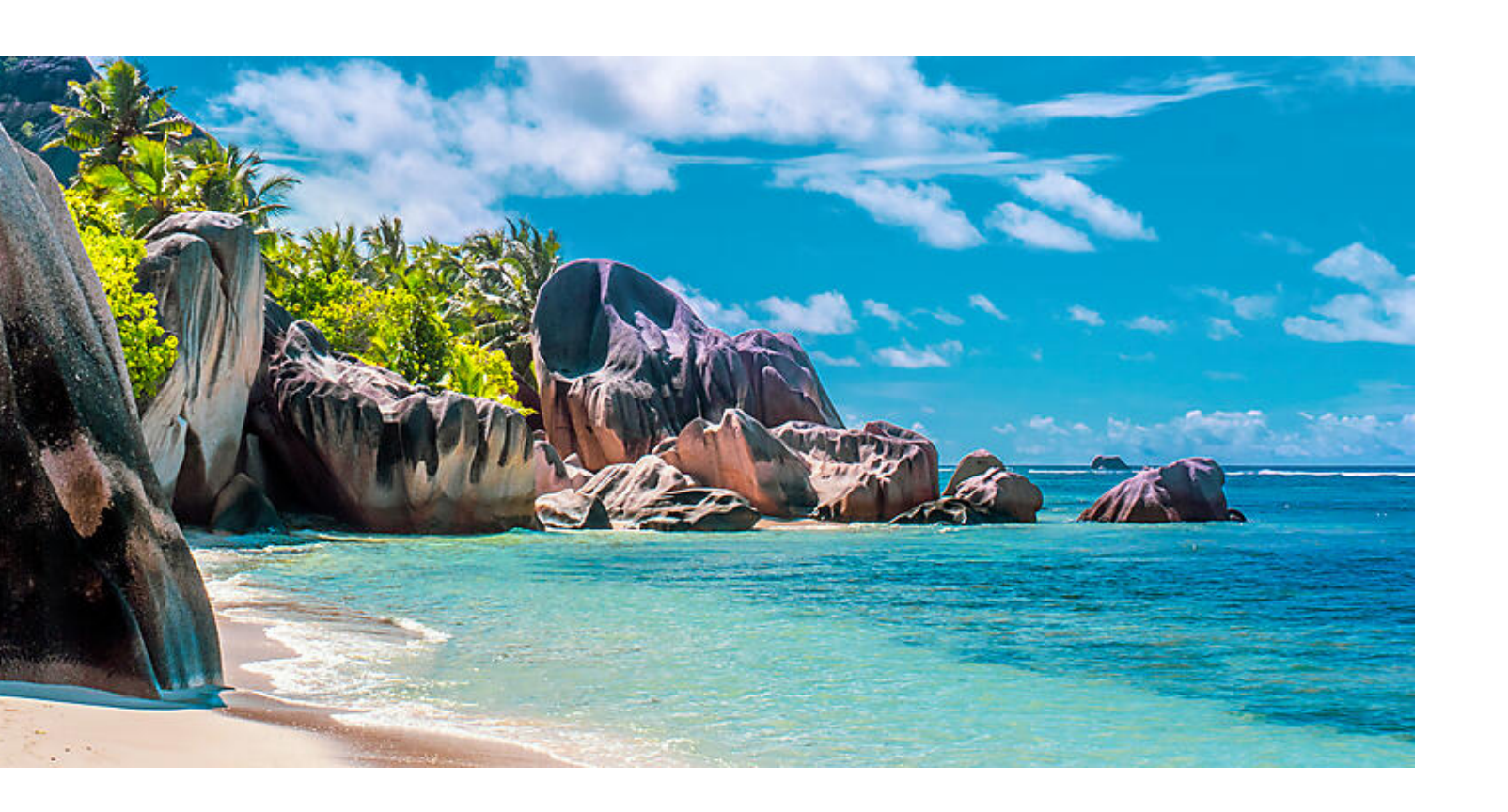
The information in this document is valid as of 17/4/2024