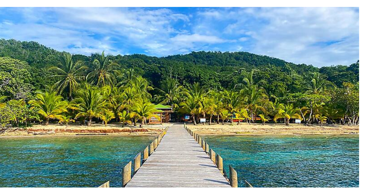
The information in this document is valid as of 23/4/2024

Half Moon Caye, the picture postcard view of Belize, is also on the programme of this cruise; in this enchanting place, you will be able to see nesting frigatebirds and red-footed boobies close up. The Great Blue Hole cenote, a UNESCO World Heritage Site, is one of the world's most stunning diving sites. On Water Caye , the Mesoamerican Barrier Reef System is also teeming with many treasures for those who venture into its waters.